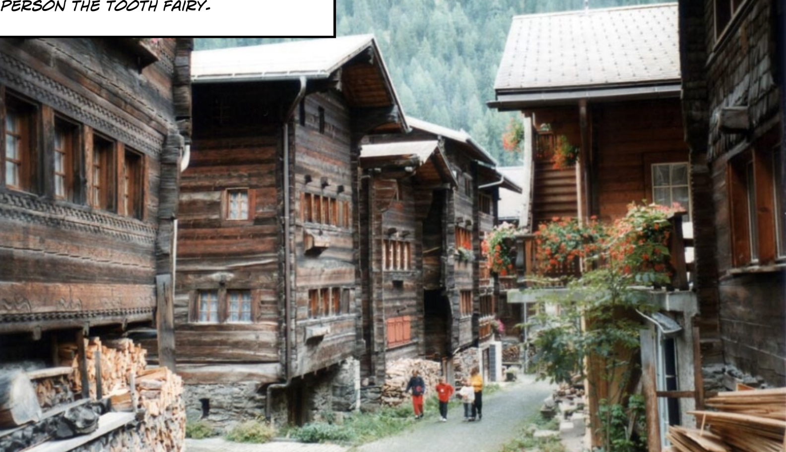
THEN THE VILLAGERS STARTED TO POINT FINGERS AND ALL OF THEM LED TO ONE PERSON THE TOOTH FAIRY.