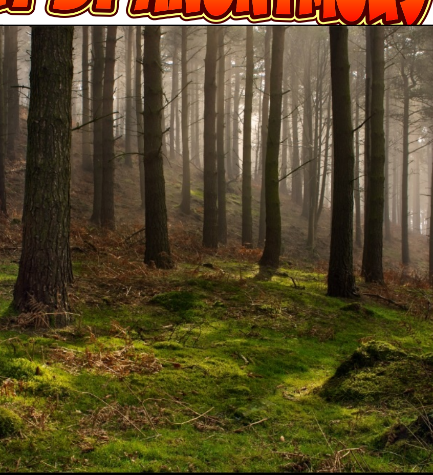
THE VILLAGERS SEARCH AND SEARCH BUT COULD NOT FIND THEM.